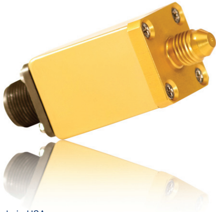
Made in USA