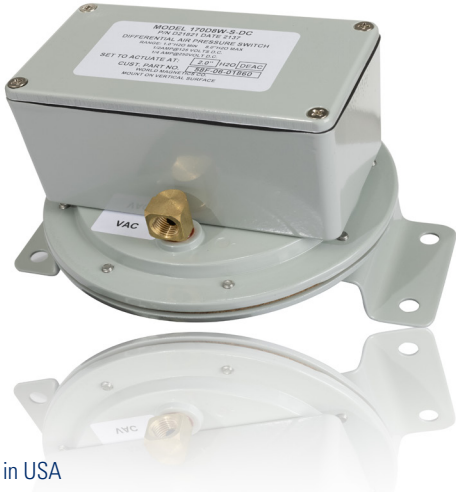
Made in USA