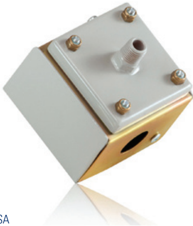
Made in USA